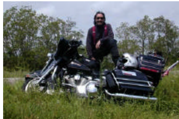
The FLH ElectraGlide Classic ended up sliding at a 45 degree angle on its front crash bar, foot board and saddlebag guard. The end result was no damage!

A quick inspection showed no damage to any part of the Harley except for the flat rear tire.