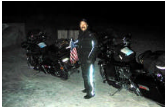
We are at the end of US 90 (SR212)/Beach Blvd. The Atlantic Ocean is 30 yards behind us. This is our halfway point! Another 2,457 miles to go!