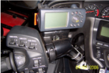
GPS on left handlebar