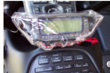
Face with Margie's rain cover